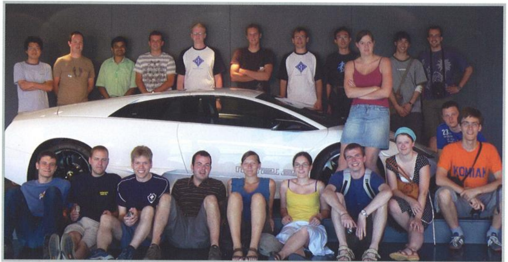
The group of 21 students from the IEEE Student Branch in Leuven, Belgium, at the Lamborghini factory in Sant'Agata Bolognese, Italy.