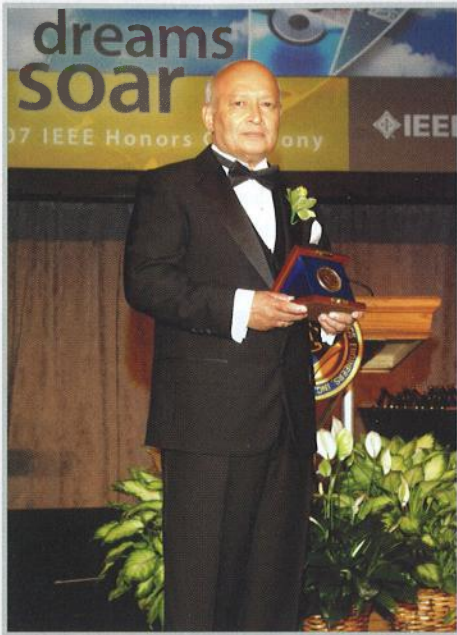
Thomas Kailath proudly displays his IEEE Medal of Honor, which is sponsored by the IEEE Foundation. He received the award "for exceptional development of powerful algorithms in the fields of communications, computing, control and signal processing."