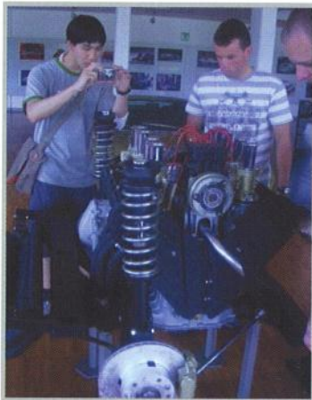
Two students from the IEEE Leuven Student Branch examine a Lamborghini engine after a tour of the factory where the cars are assembled.

At their next stop, STM Agrate, the group got to take a closer look at the technology behind flash memory and its possible replacement, phase change memory. The final company they visited was Prysmian Cables & Systems, where the power engineering students especially enjoyed a tour of the testing site for AC cables. While in Italy, the students also received an introduction to Italian culture by touring the cities of Padua, Venice and Milan.