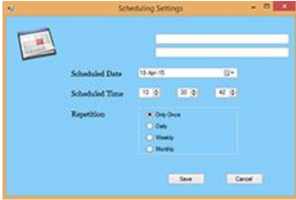
Figure 5.Scheduling settings.

Another icon of calendar is available on the main GUI for scheduling settings. A new GUI opens when the user clicks this icon. The user has to select the date and time for setting the cleaning schedule of the robot. Scheduling is done to avoid frequent unnecessary operation and make it a routine so that whenever a wake event is called from a sleep state, it manages its cleaning cycle itself in autonomous mode. Scheduling is done owing to Sections: 4.8 & 3 of IEEE Std. 1621. Moreover, the user can also select any one of the four options for the scheduling like Only Once, Daily, Weekly or Monthly. This can be viewed in Figure 5.