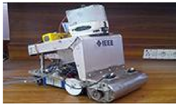
Figure 1.Mechanical Design of CLEAR.

Mechanical body consists of four parts i.e., chassis, brushing mechanism, vacuum cleaning and dirt disposal mechanism. Combination all these four parts makes a complete prototype for testing, as shown in Figure 1. Before fabrication, complete CAD Model was designed using a commercially available software.