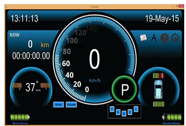
Figure 2. Graphical User Interface (GUI) for 'CLEAR'.

The main purpose of the GUI is to give all controls in the hand of user, so that he can use this product according to his needs. The software used for the programming of GUI of this device is Visual Studio 2012. As discussed, the robot can be used in manual mode as well as autonomous mode. Selection of the mode can also be done from this GUI. Visual Studio receives the data from COM port and displays it on the GUI after decoding. However, the communication via Bluetooth is 2-way i.e. it sends some data as a delivery report. The terms, indicators and labels used in GUI for power controlling and management are employed under sections: 4.3-4.6 of IEEEStd. 1621. A photograph of GUI for smart floor cleaning robot (CLEAR) is shown in Figure 2.