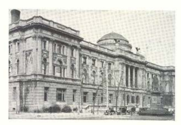
Milwaukee Public Museum and Library

All who plan to attend the meeting should register in advance by mail. A card is enclosed for this purpose. No registration fee will be charged.