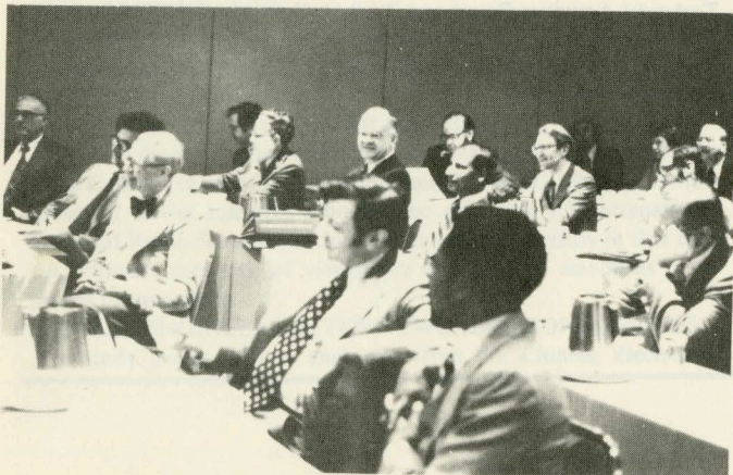
1979 Society/Group/Council (S/G/C) Orientation—A Success. (Story and more photos inside.)