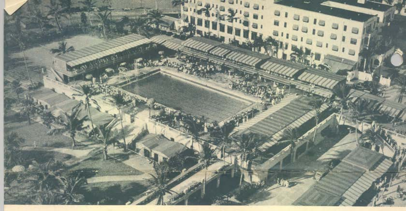
Roney Plaza Cabana Sun Club and Pool,