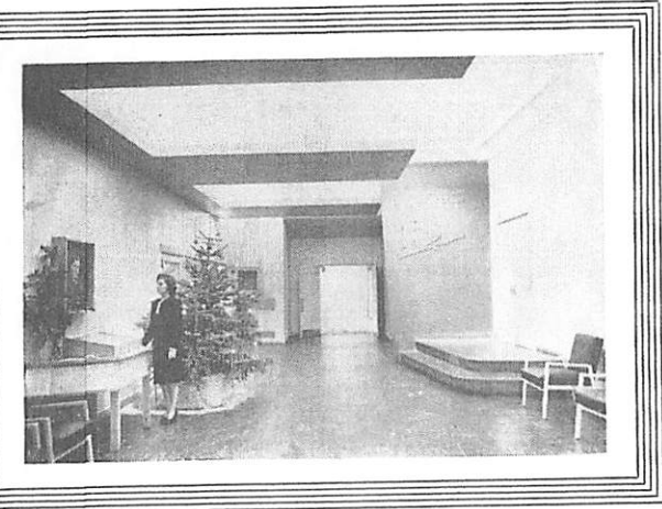
The Willkie Memorial Building was established by Freedom House and dedicated on October 8, 1945, the first anniversary of the death of Wendell L. Willkie

In addition to Freedom House, the organizations which maintain headquarters in this building include: American Council of Voluntary Agencies for Foreign Service, Anti-Defamation League (and Metropolitan Council) of B'nai B'rith, Citizens Housing and Planning Council of New York, Common Council for American Unity, International Confederation of Free Trade Unions, National Association for the Advancement of Colored People, Public Education Association, World University Service, American Institute of Graphic Arts. Many others use the meeting rooms.