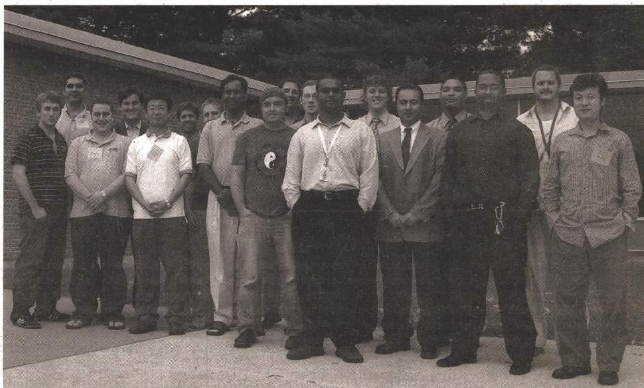
Preparing for a Virtual Challenge —Participants in a two-day workshop held at NIST in October were introduced to simulation software and test scenarios for automated guided vehicles. Each college team was provided with a desktop computer running Linux, monitor, keyboard, joystick, Unreal game engine, and NIST-developed high-fidelity simulation and control systems to prepare for an April competition focusing on accurate path following and docking.