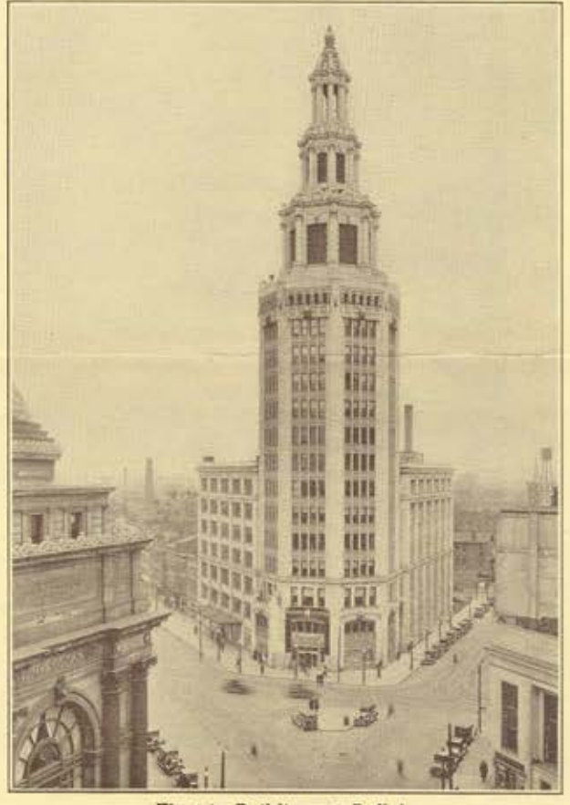
Electric Building at Buffalo

Luncheon at the Hotel Statler followed by a Fashion Show presented by one of Buffalo's smartest shops.