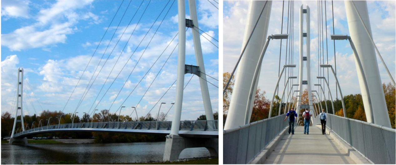
Figure 1. The Ron Venderly Family Footbridge