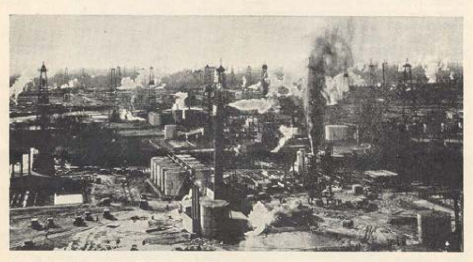
One of the items which will be of particular interest to those attending the South West District meeting is the Oklahoma City oil field adjacent to the city. This general view of a portion of the oil field was taken in 1930 from a point just adjacent to the Oklahoma City business section, and shows a large number of wells in the process of drilling