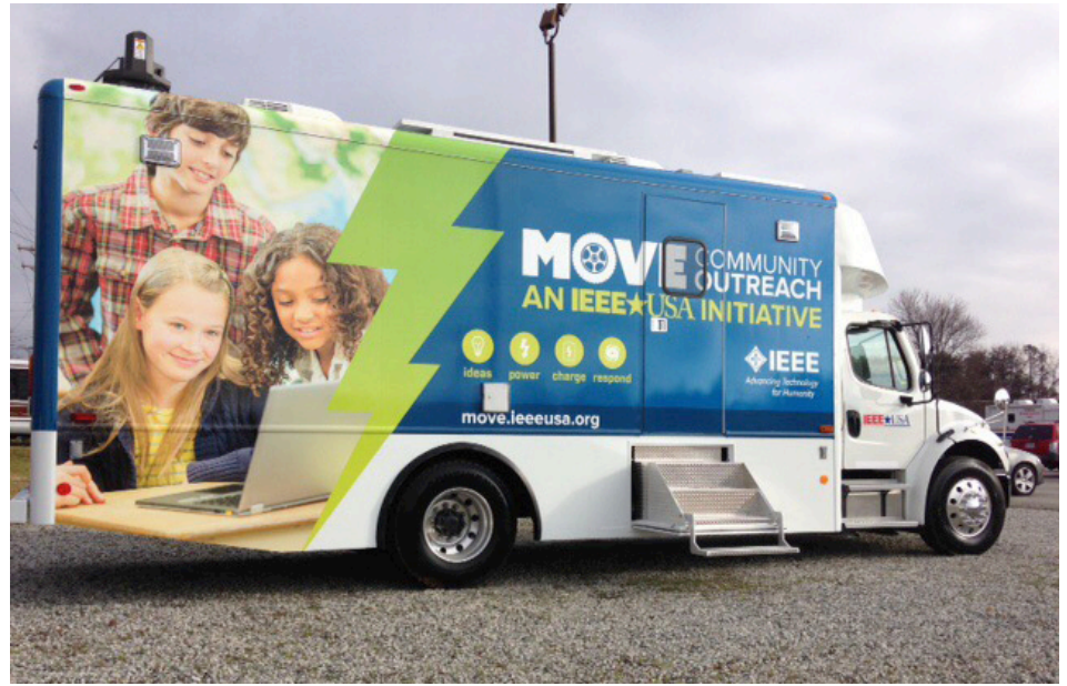
To support the MOVE Community Outreach program, make a donation to the IEEE Foundation at https://ieeefoundation.org/move

MOVE went into service in March 2016 aiding in 5 disaster situations in 2016. In 2017, with two hurricanes back to back, IEEE-USA volunteers and the MOVE truck have been very busy. The team arrived in Houston, TX, US on 26 August in response to Hurricane Harvey. Then, on 8 September, the MOVE team and vehicle were deployed to Tallahassee, FL, US to position itself for Hurricane Irma. When not deployed for natural disasters, MOVE volunteers conduct STEM related community outreach.