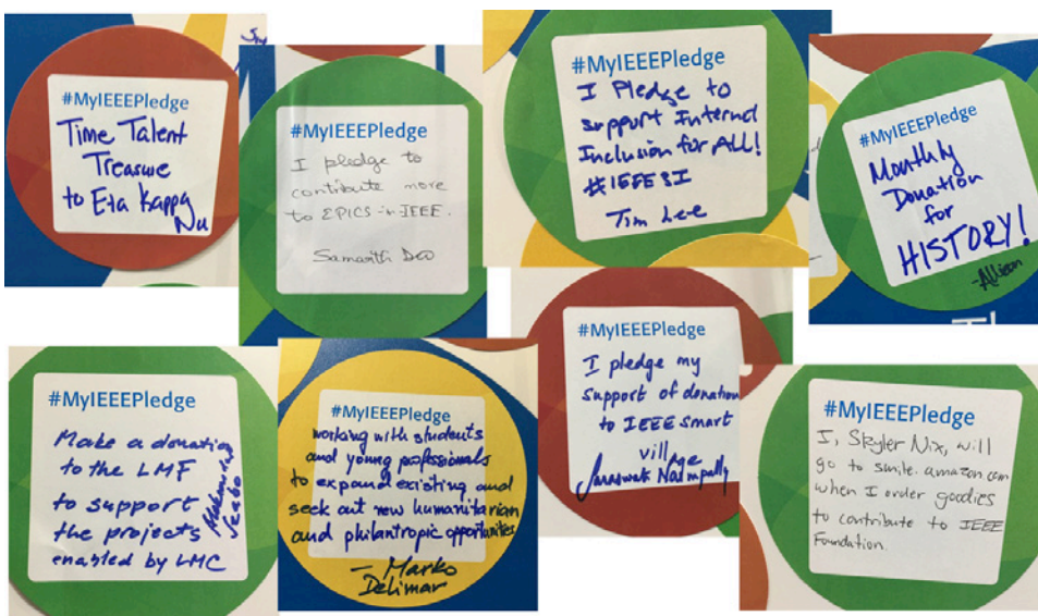
A sampling of pledges of Time, Talent and Treasure from visitors to the H&P Pavilion at IEEE SC2017.

Congratulations and thank you to all who helped plan and execute our presence at SC17. It was an incredible time that generated a new level of excitement about the impact of the IEEE Foundation and will pay dividends into the future. Both the IEEE Foundation and the IEEE Life Members Committee supported the SC2017 at the $25,000 level.