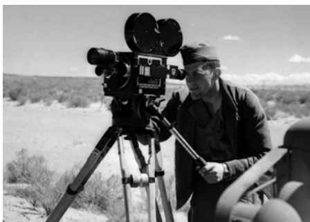
A Manhattan Project worker with a high-speed camera at the Trinity Site in the summer of 1945.

The Los Alamos/Northern New Mexico IEEE Section worked with the Atomic Heritage Foundation (AHF) to produce Los Alamos Innovations . The program is part of AHF's Ranger in Your Pocket