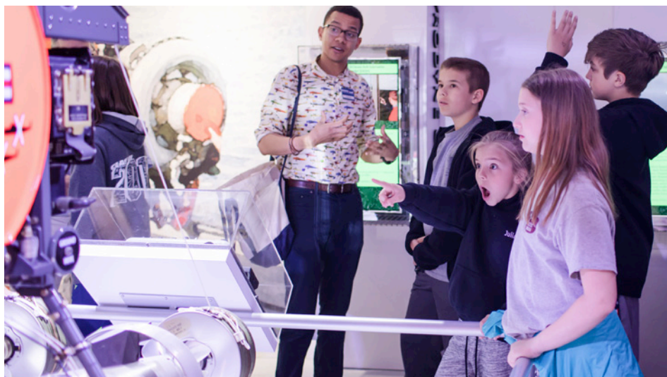
Students of all ages are excited about the multiple offerings at Drones Exhibit.

For more information visit: www.intrepidmuseum.org/drones