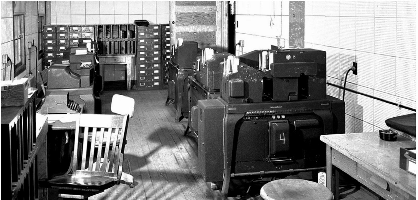
Early IBM calculating machines at Los Alamos, NM, US.