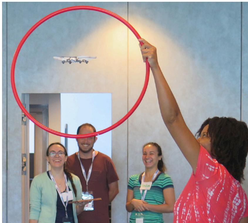
Teachers learned how to use UAV's and gained extensive practice flying and coding Parrot Minidrones, which they were able to keep for use in their classrooms.

"Applying drone lessons and combining history with technology." 7th grade math teacher