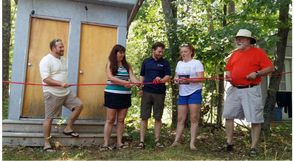
EPICS in IEEE and Christie Lake Kids celebrate with a ribbon cutting after completing a solar project for economically disadvantaged children that brought hot showers to their remote campsite.

This is just another way EPICS in IEEE is helping youth around the world understand the importance and impact of environmentally friendly technology.